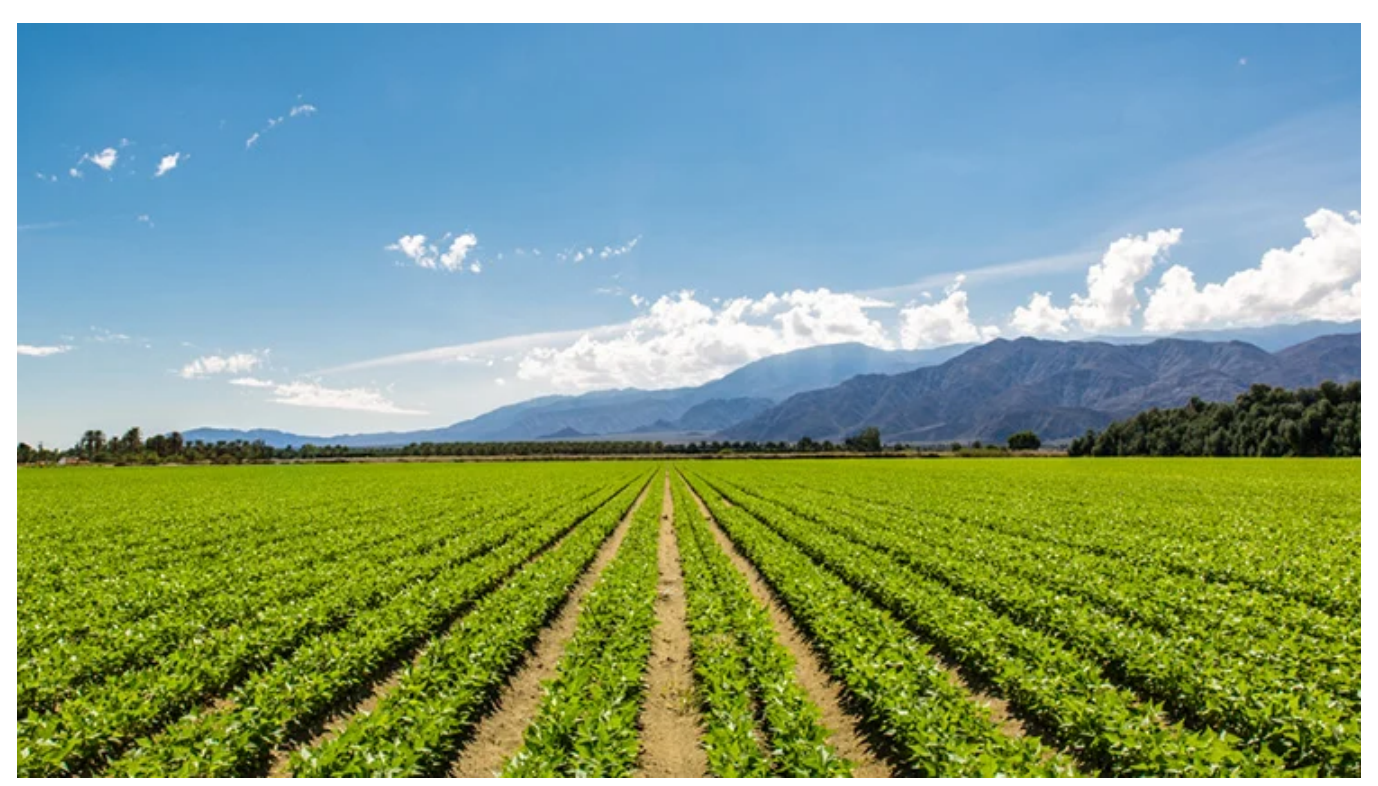
On 25 January 2017, the ATO released Taxation Determination 2017/1 regarding the taxation treatment of intangible capital improvements that are affixed or made to pre-CGT assets. The ATO has provided an example of the type of taxpayer that this determination is targeting: