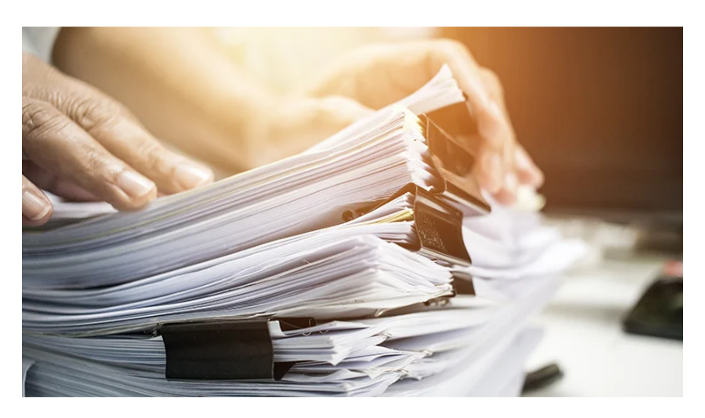
It's all in the detail!